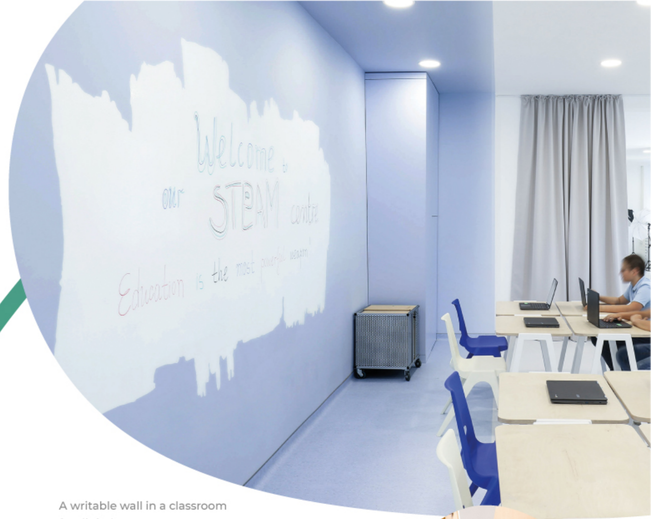
A writable wall in a classroom for digital creators. STEAM Centre