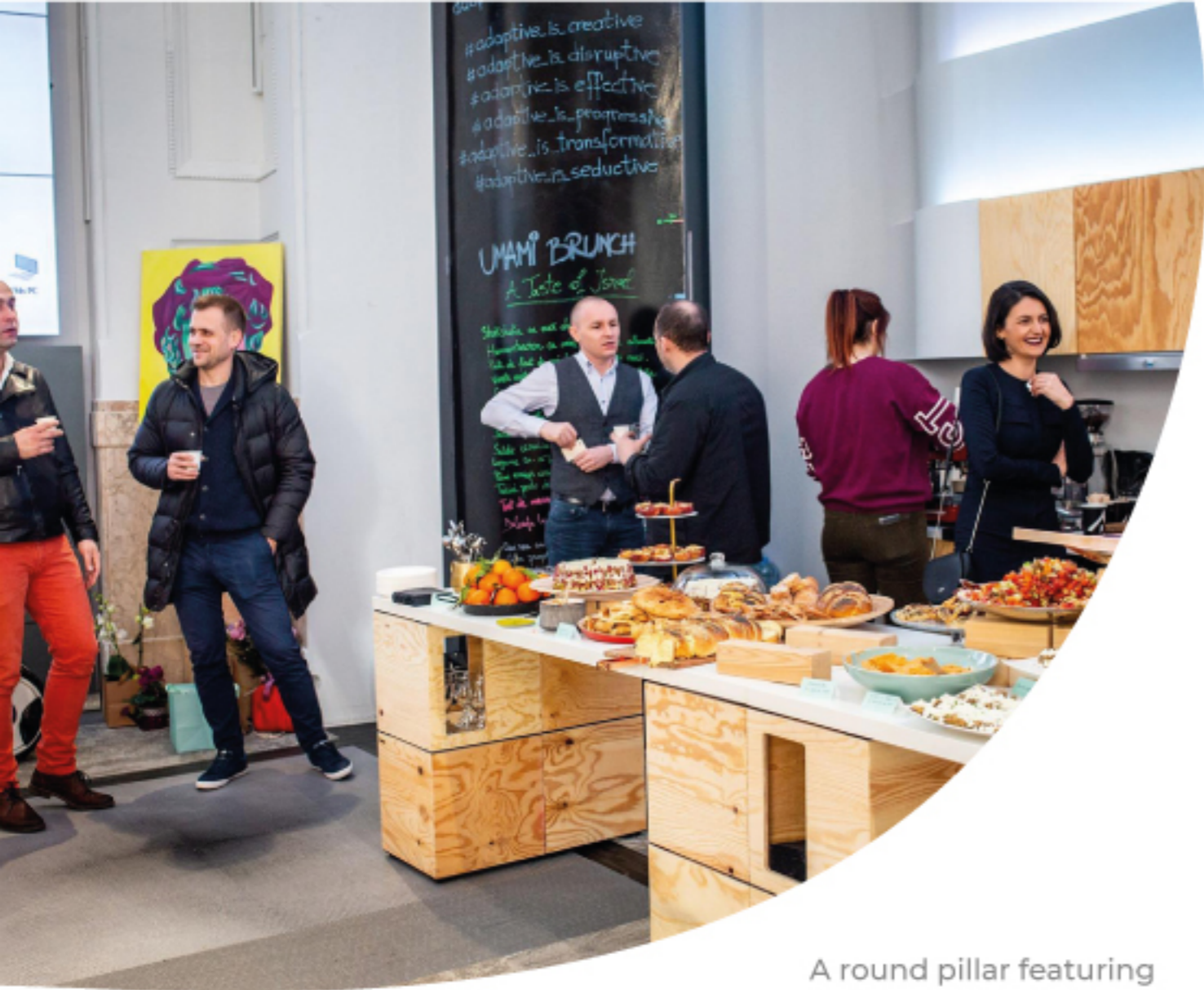
A round pillar featuring event-tailored messages. Adaptive Work Environment