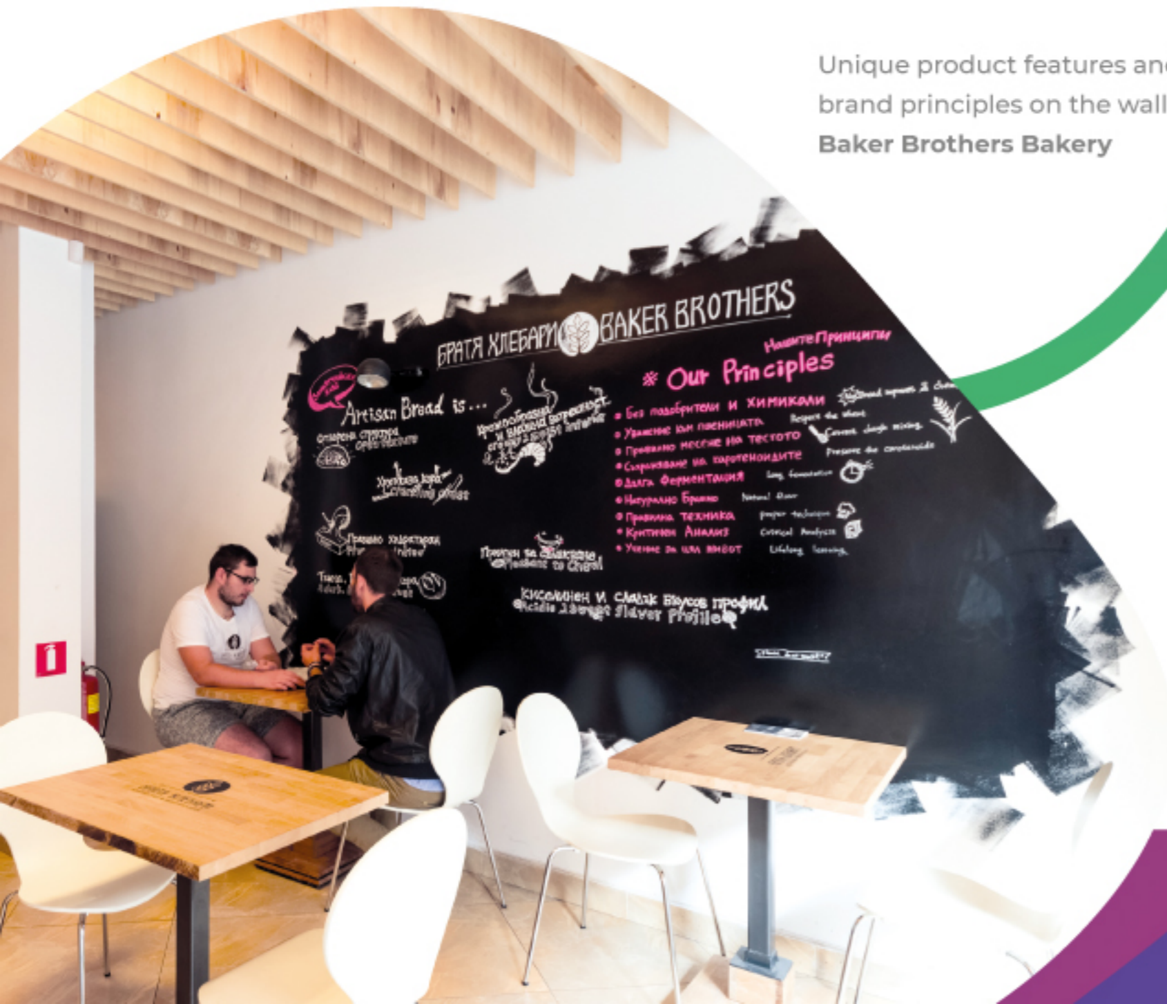
Unique product features and brand principles on the wall. Baker Brothers Bakery