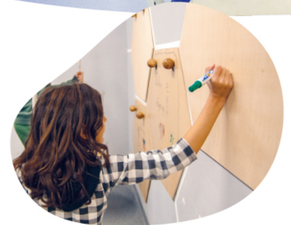
A writable honeycomb for children to grasp every creative idea. Primary School